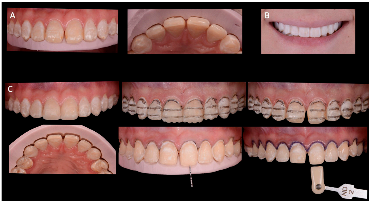
Figure 2. Reduction guide, mock-up, dental reduction process and shade taking. A) Vestibular view of the reduction guide in the mouth and incisal view of the reduction guide at the middle third level. B) Frontal smile with a mock-up. C) Intraoral photographs of the dental reduction process and the shade taking of the mock-up made from second premolar to second premolar, preparation guide grooves carved on the mock-up and marked with graphite, guide grooves marked on the teeth once the mock-up has been removed, corroboration of the dental reduction with the reduction guide from an incisal view at the level of the incisal third, dental reduction of 1 mm from a vestibular view corroborated with a probe and reduction guide, and stump shade measurement with colorimeter. The Shade Navigation App was used to select the opacity of the glass-ceramic.

Reduction grooves were prepared on the mock-up to a depth of 0.3 mm with a BR-45 bur (Mani® dia-burs®, Mani Inc., Japan), the mock-up was removed, and the guide grooves were recorded on the teeth, which were marked with a graphite. Continuing with the preparation, a TR-13 bur (Mani® dia-burs®, Mani Inc., Japan) was used to perform the wear at the indicated depth (0.3 to 0.6 mm), which was confirmed with the reduction guides. The surface finish preparation was carried out using TR-13F, TR-13EF burs (Mani® dia-burs®, Mani Inc., Japan), Sof-Lex discs and polishing rubber (3M™ Sof-Lex™ Finishing Strips Basic Kit, 3M espe Deutschland GmbH, Germany), the finish was at the level of the equigingival margin. Once the preparation was completed, the double thread gingival retraction technique was used 9 , the first thread being #000 black and a second thread being #0 purple (Ultrapak™ and Ultrapak™ E, Ultradent Products Inc., South Jordan, Utah, USA), to select the opacity of the glass-ceramic (Figure 2. C) we used the Shade Navigation App (IPS e.max Shade Navigation App, Ivoclar Vivadent AG, Liechtenstein).