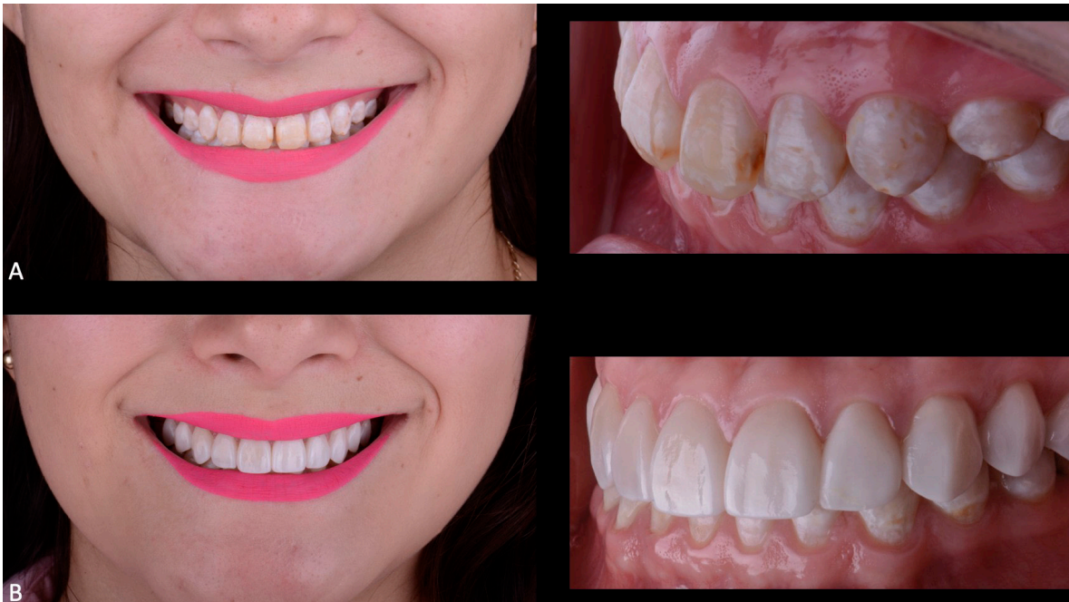
Figure 4. Initial and final facial and intraoral photographs. A) Front smiling and lateral \frac{3}{4} initial intraoral. B) After cementation of the veneers from the smiling front and lateral \frac{3}{4} intraoral.

When the stated objectives were met, the dental aesthetics of the anterior sector improved; when smiling the gingival architecture was more harmonious; the dyschromia caused by fluorosis was covered; a better shape and proportion in size was given to the teeth; the existing diastema was closed; the smile line was aligned following the curvature of the lower lip; it was possible to match the facial midline with the dental midline, and the establishment of organic occlusion characteristics was obtained (Figure 4. A-B).