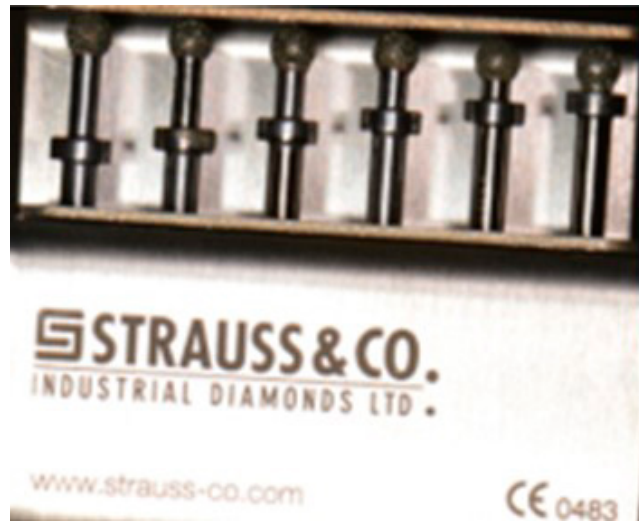
Figure 2. STRAUSS & CO® Safe Sinus Lift Kit Instrumentation.

enabled the displacement of the maxillary sinus floor and Schneiderian membrane, favouring the increase in length in the new bone height obtained.