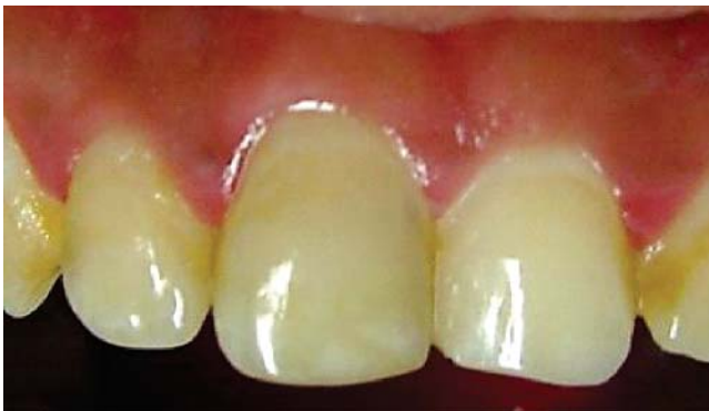
Figure 6. Three month control visit, hue similar to neighboring teeth can be observed.

pathological data, with no alterations in the color of the tooth (Figure 5).