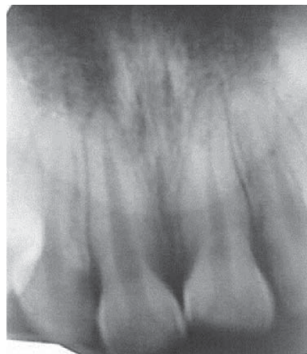
Figure 2. Initial X-ray, no radio-lucid area can be observed.