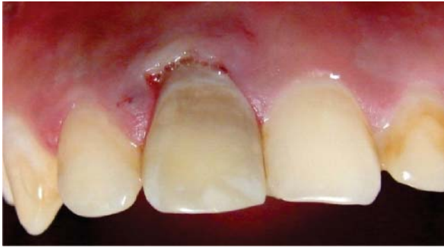
Figure 4. Minimal dyschromia after whitening procedure.