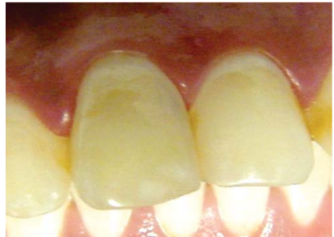
Figure 7. Six-month control visit. Absence of dyschromia is observed.

Whitening agents can be made of hydrogen peroxide H_2O_2 (common peroxide), carbamide peroxide ( CH_4N_2O.H_2O_2 ) or they can equally be made of sodium perborate 2 ( NaBO_3 ); in this last instance, sodium perborate can be associated to distilled water, physiological saline or hydrogen peroxide. 3 Hydrogen peroxide is a strong whitening agent, therefore, it must be used with great caution. One study states that internal whitening of non vital teeth using hydrogen peroxide at 30% concentration, either with or without sodium perborate, and equally with or without heat, can represent an efficient option to re-establish aesthetics in approximately 50% of treated cases. 1