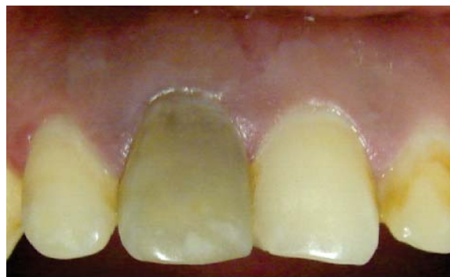
Figure 1. Dyschromia of upper right central incisor.

Thirty days after performing the whitening procedure, and after a clinical and radiographic assessment, it was determined to definitely fill the pulp cavity with a light-polymerizing composite material (Tetric N/Ceramic®). This was decided based on the suitable clinical circumstances and absence of