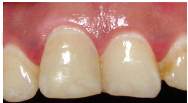
Figure 8. Twelve month control: suitable clinical circumstances can be observed.