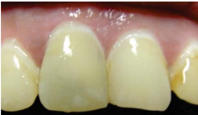
Figure 5. Thirty days after procedure suitable hue can be observed.