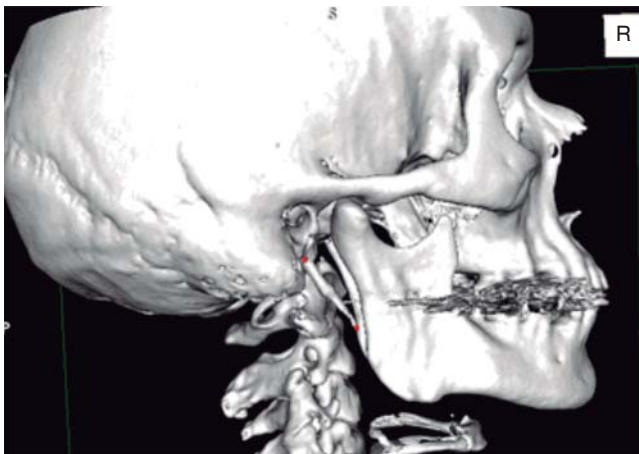
Figure 1. CAT with 3D reconstruction showing elongation and calcification of the stylohyoid ligament.

sent to histopathological analysis. Suture by planes was executed with internal inverted simple sutures, skin was sutured with 6-0 subdermal nylon. Surgical procedure was completed with no further accidents or incidents. A compressive dressing was placed on the right submandibular region. The patient was sent to recovery and was hemodynamically, cardiopulmonarily and neurologically stable (Figures 2 to 5). The patient was discharged the following day, the dressing was removed, suitable healing of the surgical wound was observed, no blood collection or egress of material was noted. Seven days later, the patient exhibited suitable healing with decrease of painful cervical symptoms as well as limited neck lateral movements. Tomography images were requested in order to assess surgical treatment (Figure 6). Three months later the patient exhibited mild painful symptoms located at the right sternocleidomastoid muscle, with mild limitation of