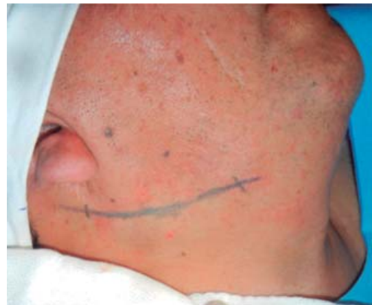
Figure 2. Markings previous to approach.

sent to histopathological analysis. Suture by planes was executed with internal inverted simple sutures, skin was sutured with 6-0 subdermal nylon. Surgical procedure was completed with no further accidents or incidents. A compressive dressing was placed on the right submandibular region. The patient was sent to recovery and was hemodynamically, cardiopulmonarily and neurologically stable (Figures 2 to 5). The patient was discharged the following day, the dressing was removed, suitable healing of the surgical wound was observed, no blood collection or egress of material was noted. Seven days later, the patient exhibited suitable healing with decrease of painful cervical symptoms as well as limited neck lateral movements. Tomography images were requested in order to assess surgical treatment (Figure 6). Three months later the patient exhibited mild painful symptoms located at the right sternocleidomastoid muscle, with mild limitation of