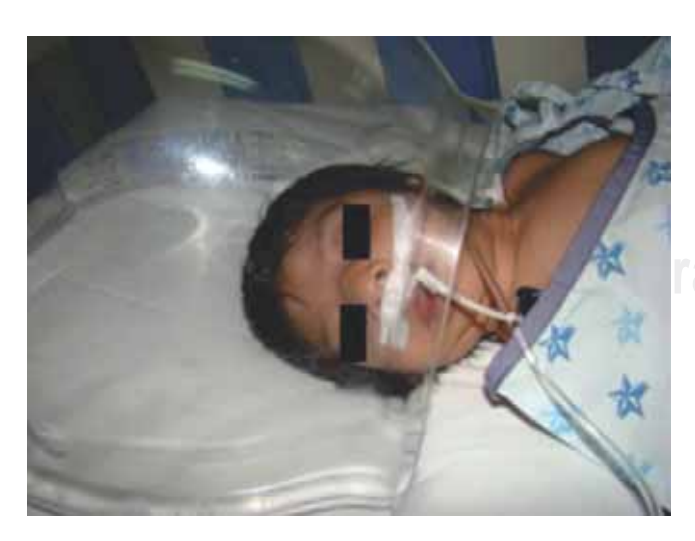
Figure 3. Patient in ER due to dehydration and hypernatremia after failed attempt to perform oral feeding.

The next day, the mother requested opening of a clinical file at the pediatric out-patient service where staff attempted to achieve suction and deglutition processes. The pediatrician diagnosed absence of these reflexes, since, when feeding, there was milk runoff through the corners of the lips. This was due to the patient's inability to swallow. When taking clinical history, pallor and respiratory pause were observed. The child was instantly stimulated and recovered on the spot. The child was at that point referred to emergency prehospitalization service (Figure 3). As a result of probe removal, the child experienced emetic and dehydration events. These events conditioned presence of hypernatremia (increase of sodium level in the blood). This can cause muscle spasms and death, as well as dehydration and malnutrition. This case was important to highlight the fact that interdisciplinary approach must prevail in all treatments of this kind, and also the need to avoid making unilateral decisions, since this might endanger a newborns life. Management of this patient was not optimal, since the child was exposed to unnecessary risks. Adventuresome, unsupported decisions were taken. Upon removal of the transpyloric probe the