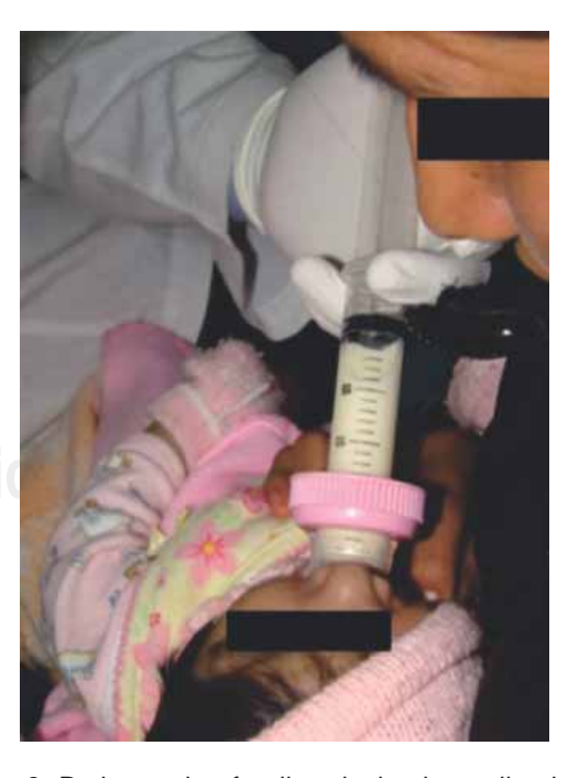
Figure 2. Patient using feeding device immediately after removing the probe.