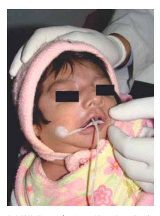
Figure 1. Initial picture of patient with assisted feeding probe into place.

reflex, the index finger was introduced into the patient's mouth and pressure was exerted against the palate. At this point, the child exerted pressure upon the finger, and the tongue was able to embrace the