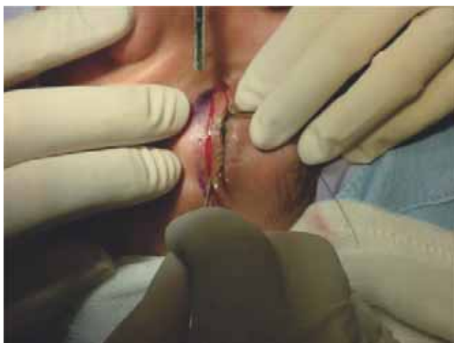
Figure 3. Design and incision of sub-ciliary approach described by Converse