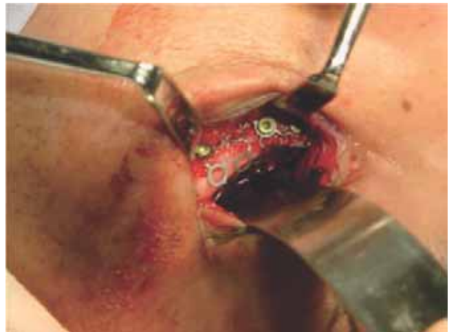
Figure 4. Titanium mesh placement site and fixation to the orbital rim with mono-cortical screws.