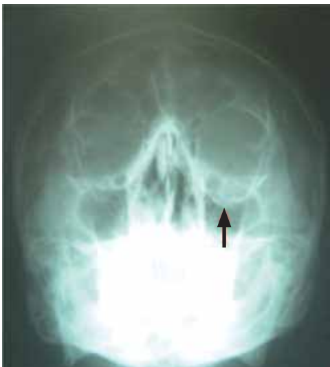
Figure 2. Arrow points to the fracture site. Orbital contents herniation towards the maxillary sinus is observed.

Usage of Titanium mesh to fixate the orbital rim for reconstruction of orbital floor fractures represented an adequate treatment alternative, since it avoided creation of a second surgical site to obtain donor graft material. It also provided resistance as well as the certainty that the mesh would not suffer displacements since it was fixated to the orbital rim with mono-cortical screws. Displacement might occur when placing a non-fixated alloplastic graft (medpore, methacrylate).