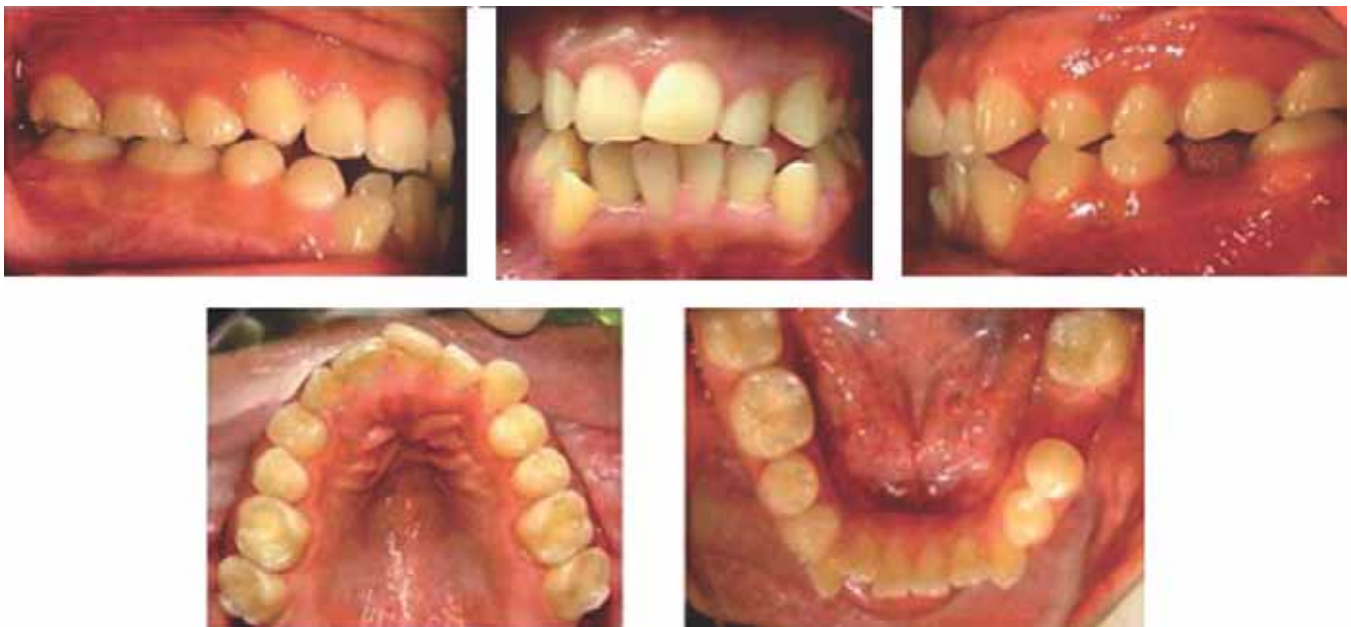
Figure 2. Initial intra-oral pictures. The following can be observed: right molar class III, left canine class II, discrepancy between dental midlines, absence of left lower first molar and right upper canine as well as moderate crowding and posterior crown wear.