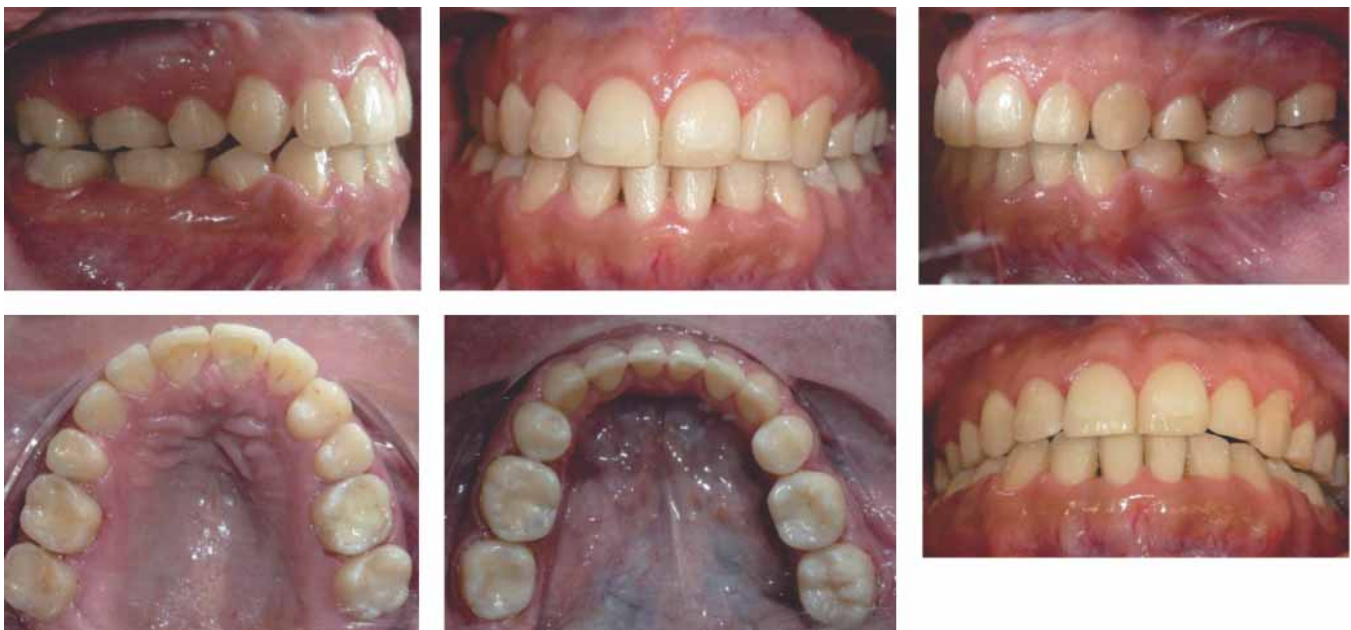
Figure 5. Final intra-oral photographs. Upper right canine and lower left first molar were substituted. Right molar class III was preserved, left molar class I was achieved. Due to mandibular deviation, canine class I was not achieved. Midline coincidence was not reached.