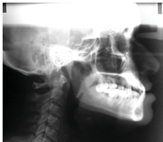
Figure 4. Initial lateral headfilm.

profile; canine guidance was achieved by means of prosthetics. Bilateral molar class I was also obtained as well as coincident midlines, improvement of the smile, a positive overjet and overbite, periodontal health and occlusal function.