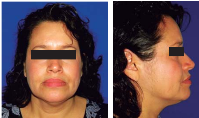
Figure 1. Initial facial photographs, frontal and profile views, where a depressed middle third may be observed as well as an increased lower third, brachifacial biotype and a concave profile: all characteristic of a skeletal class III.

Retention was achieved through circumferential retainers on both arches plus fixed retention from lateral incisor to lateral incisor in the upper arch for the subsequent rehabilitation. Total treatment time was 34 months.