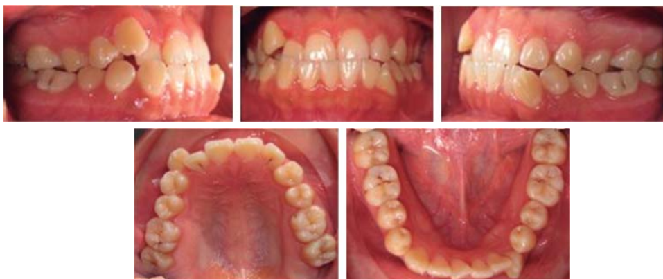
Figure 2. Initial intraoral photographs.