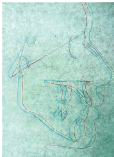
Figure 8. Pre and post-treatment cephalometric superimposition.