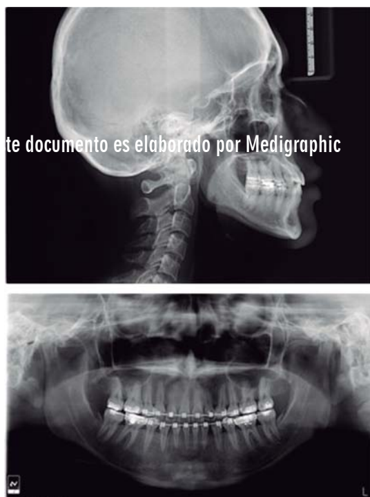
Figure 7. Final radiographs.

and a carefully executed treatment plan, as well as the initial dento-skeletal characteristics of the patient that fell within the parameters susceptible of being corrected through orthodontic biomechanics. Orthognathic surgery was avoided with the times, risks and costs that it implies.