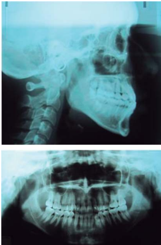
Figure 3. Initial radiographs.

The notable improvement in the profile, smile and occlusion of the patient is an important point