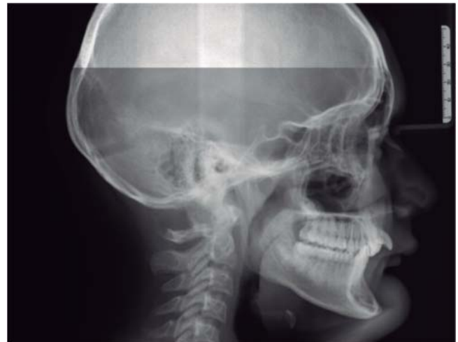
Figure 1. Initial lateral cephalogram.

Skeletal class I with as much improvement of the profile as possible, eliminate dental crowding,