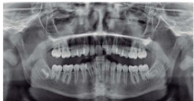
Figure 2. Initial orthopantomography.