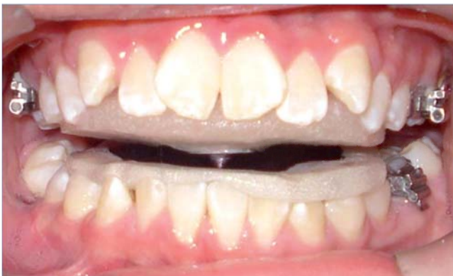
Figure 4. Plates for centric relation registration with the gothic arch tracing technique.