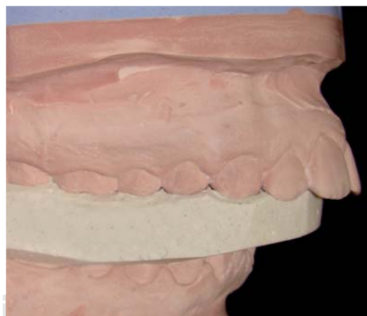
Figure 6. Fixation of the centric lock in the vertex of the tracing. (Centric relation).