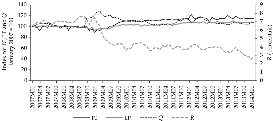
Figure 1 Manufacturing international competitiveness (IC), labor productivity (LP), real bilateral exchange rate (Q) and real interest rate (R)