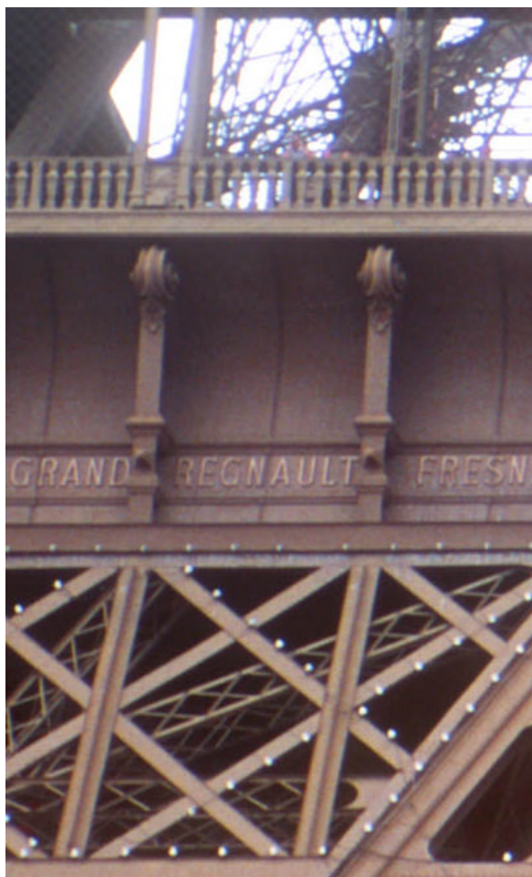
Figure 1. Regnault's name in Eiffel's tower.

cribed to the mechanical theory of heat “for a long time” and that he had been led to it independently through his own experiments (Regnault, 1853; Fox, 1971).