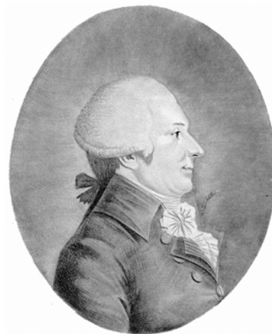
Figure 1. Louis-Bernard Guyton de Morveau (1737-1816).

Guyton de Morveau’s reputation is based more on his dedication to the teaching of chemistry and its application to industry, that on his experimental work, that nevertheless were numerous. The most