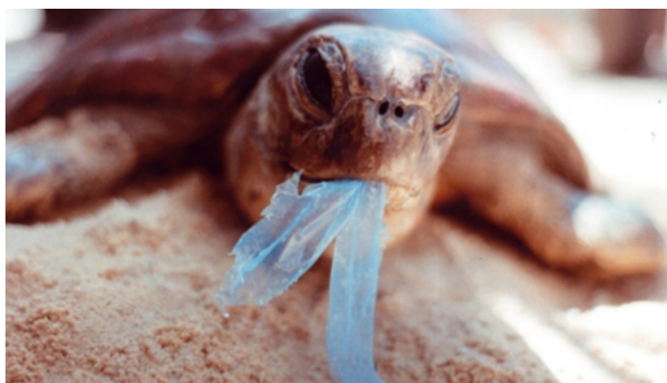
Figure 3. According to the North Carolina Aquarium, all sea turtles are listed as endangered or threatened. Plastics in the ocean is one contributing factor (North Carolina Aquarium).

The points of entry are likely to change with the passage of time: As strong, flexible, durable and/or waterproof, plastics are incredibly useful materials. However, in recent years we have learned just how durable plastics really are. The “immense eternal footprint