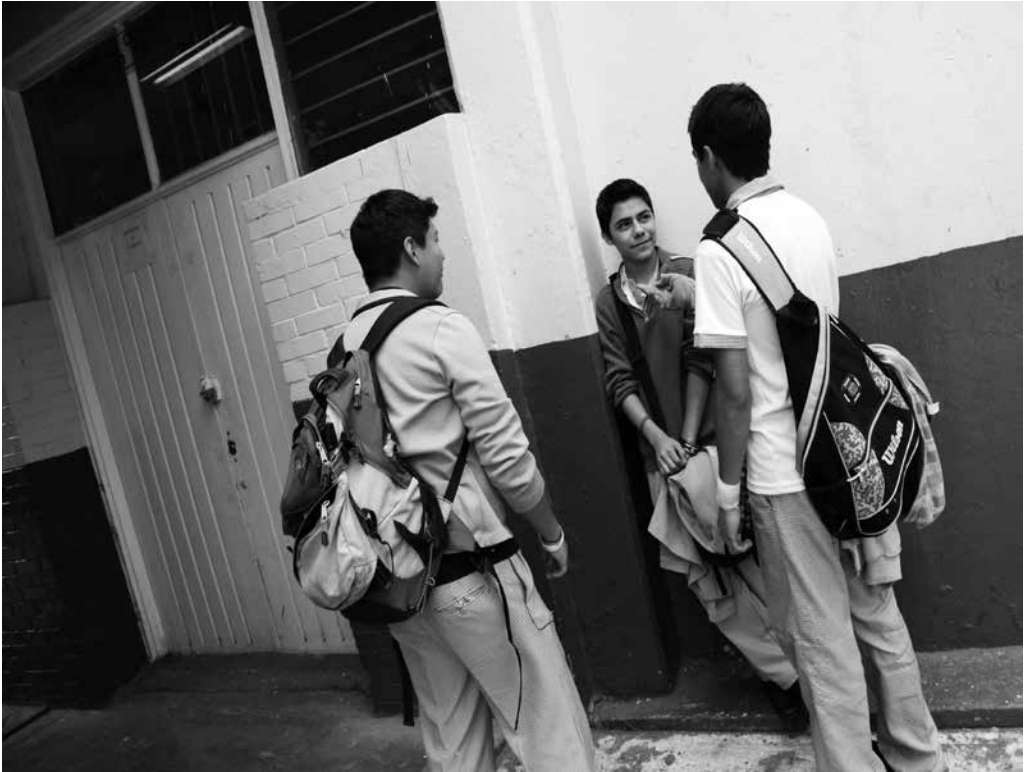
Schools, Immersed in Conflictive Surroundings.