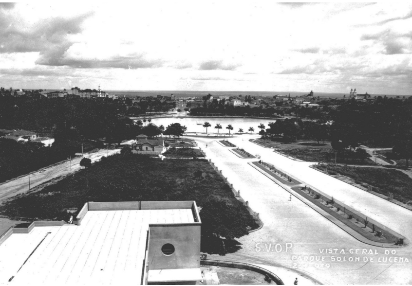
View from the upper terrace of the main building of the Education Institute after its inauguration (1939), João Pessoa. Archives of the Historical and Geographical Institute of Paraíba

that allowed for the creation of Lagoa Park, where Getúlio Vargas Avenue heads towards the sea.