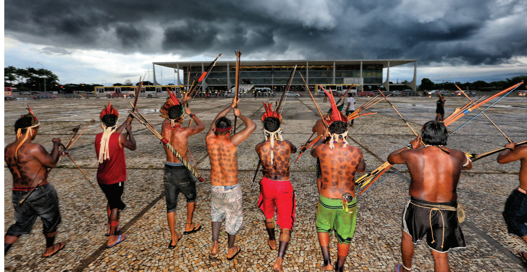
Brazilian Indians pointing their arrows at the Planalto Palace in protest against the bill PEC 215, which would give Congress the right to regulate indigenous lands.