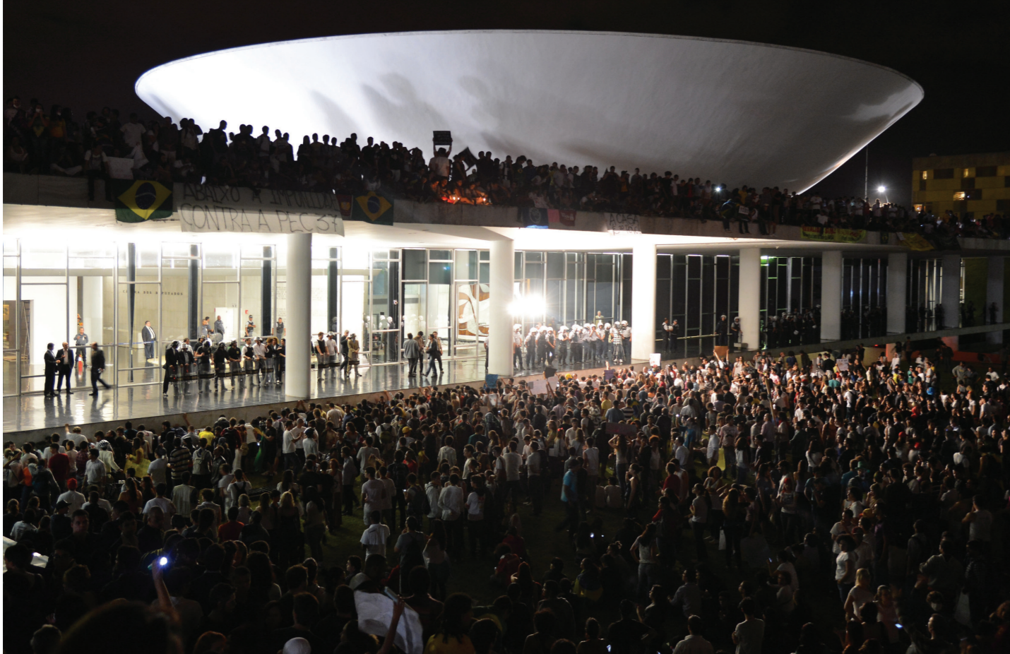
Photograph published by O Globo newspaper on June 18, 2013, 3.