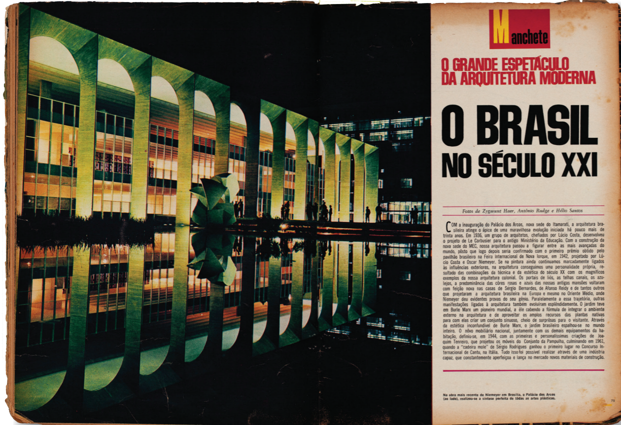
Manchete 797 (July 1967), 75