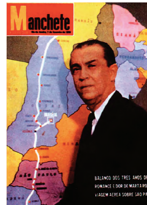
Cover of Manchete magazine, 1959

the economic costs of this miraculous adventure had repercussions on the country's external debt for years to come; on the other, the social costs—assassinations and restrictions of human rights through torture and the lack of the freedom of speech—indirectly affected 31,000 people, according to data from the Comissão da Verdade (Truth Commission). 19