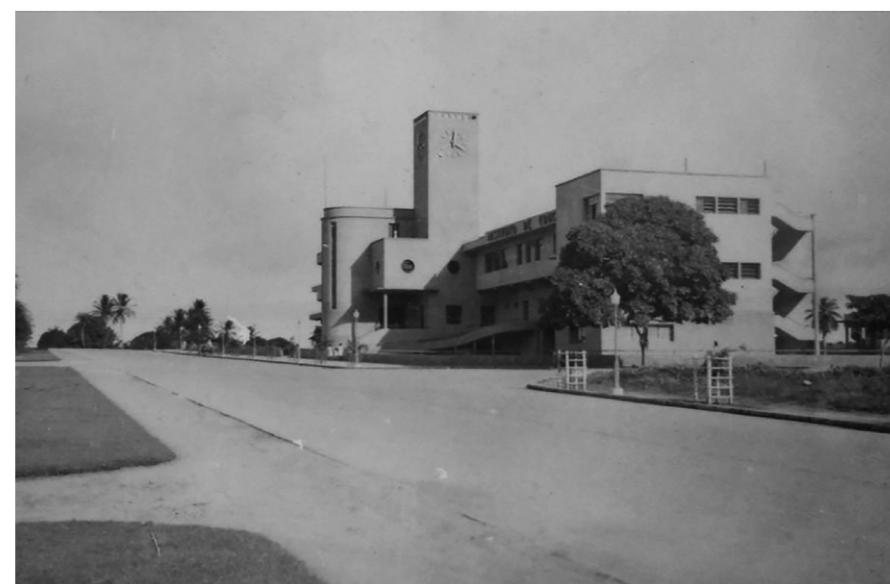
The main building of the Education Institute after its inauguration (1939), João Pessoa.

Until 1974, the country grew at an impressive pace through the phenomenon known as the "economic miracle," represented by the construction of hydroelectric power plants, roads and bridges. On the one hand,