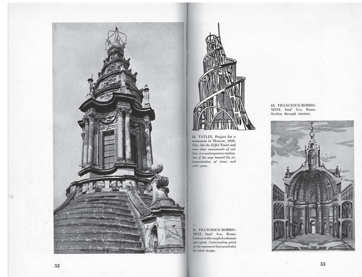
Pages from Sigfried Giedion's Space, Time and Architecture: The Growth of a New Tradition (1973)