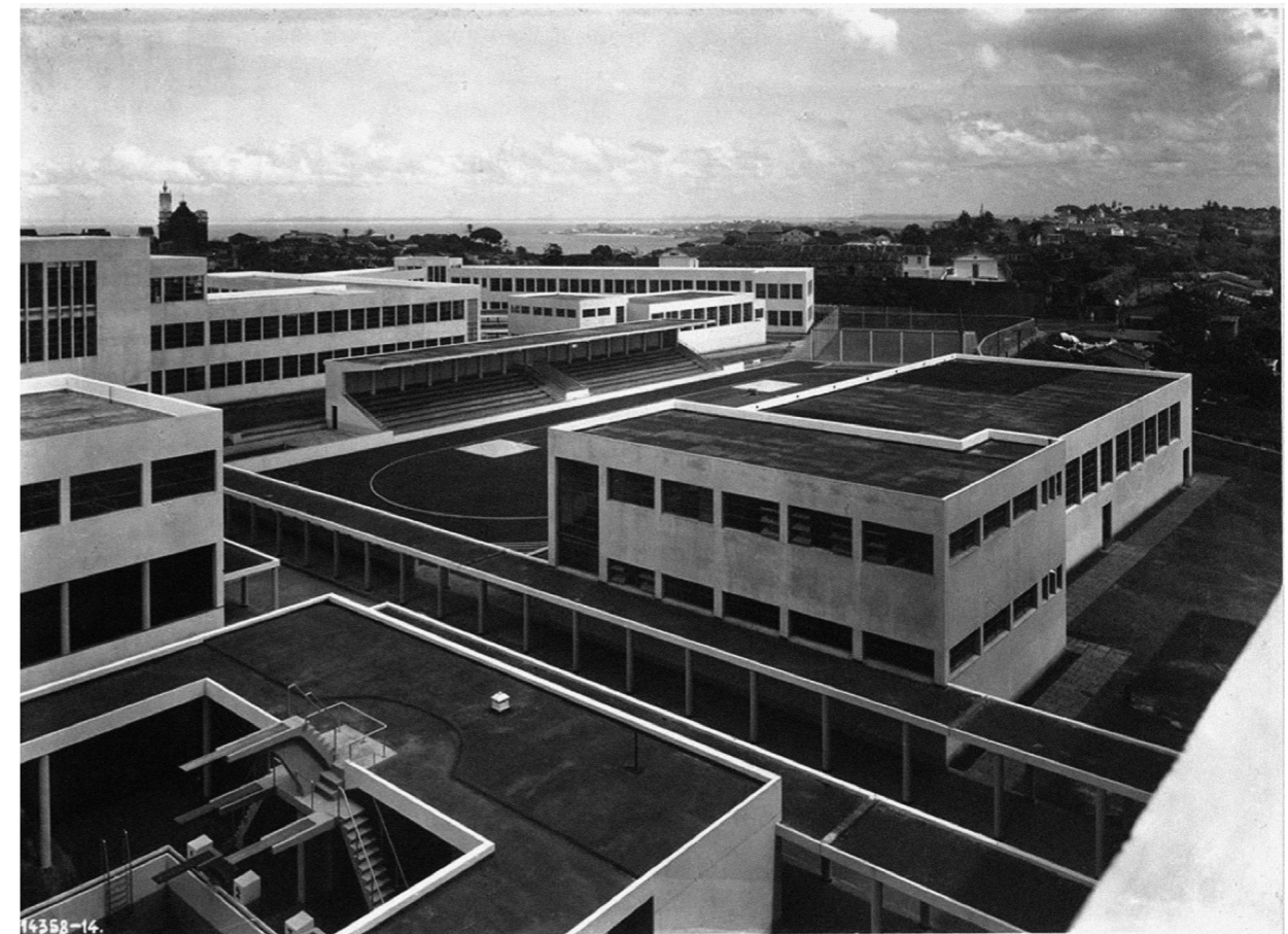
Isaiás Alves Central Education Institute (ICEIA) in Salvador, formerly known as the Bahia Normal School.