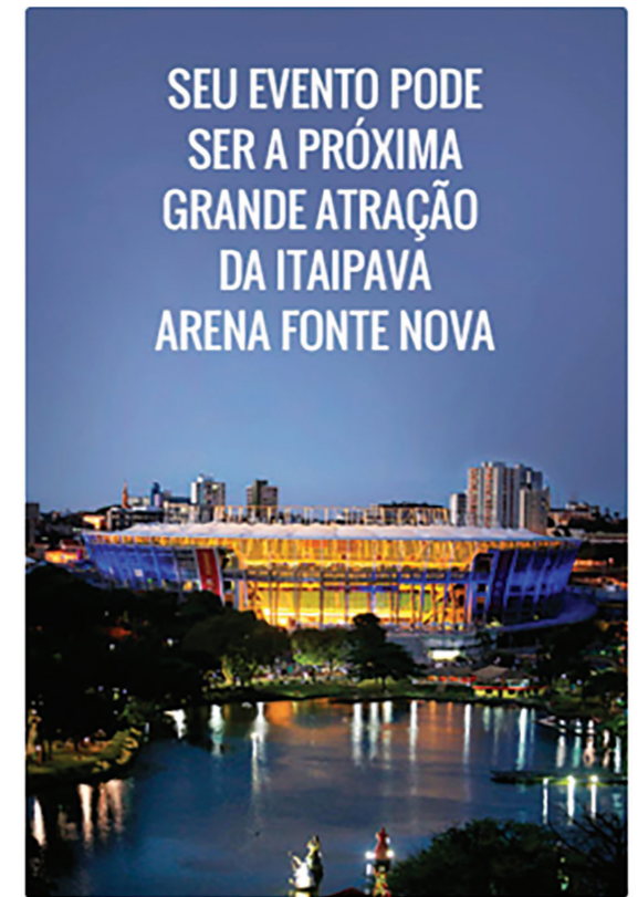
Advertisement for the "new" Fonte Nova Arena, owned by a brewery: "Your event could be the next great attraction of the Itaipava Fonte Nova Arena." Online advertisement

The very Manchete magazine that celebrated Brazilian architecture in 1967 had declared one decade earlier (in 1958) that Brazil was the country of music, soccer and architecture. Sixty years later, we have very little architecture to celebrate, and our World Cup ended with the pathetic score of seven to one when Germany beat Brazil in the semifinals on July 7, 2014. Only music remains as the image of a country that has lost its way.