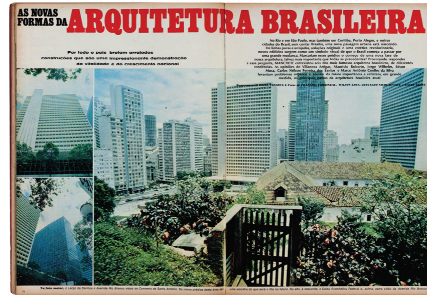
Manchete 1130. (December 1973)