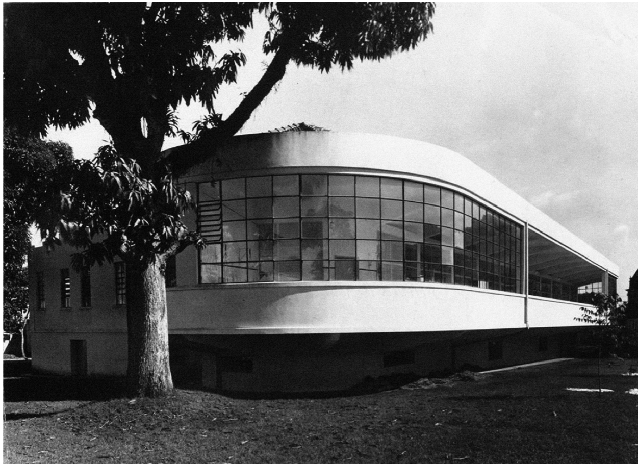
Juracy Magalhães Nursery School.