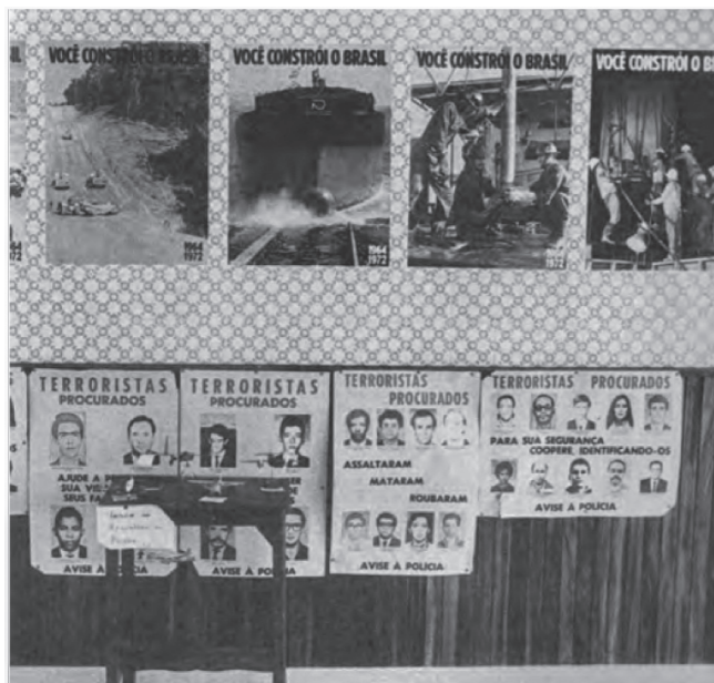
The Brazilian government's institutional propaganda, early 1970s. Elio Gaspari, A Ditadura Escancarada (2002)