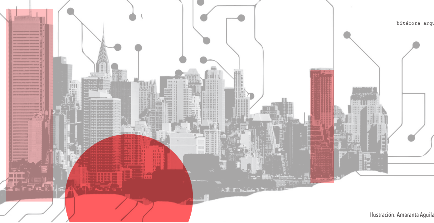
Ilustración: Amaranta Aguilar Escalona