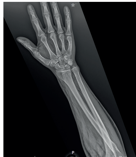
Figure 1. Right hand X Ray. Subcutaneous emphysema